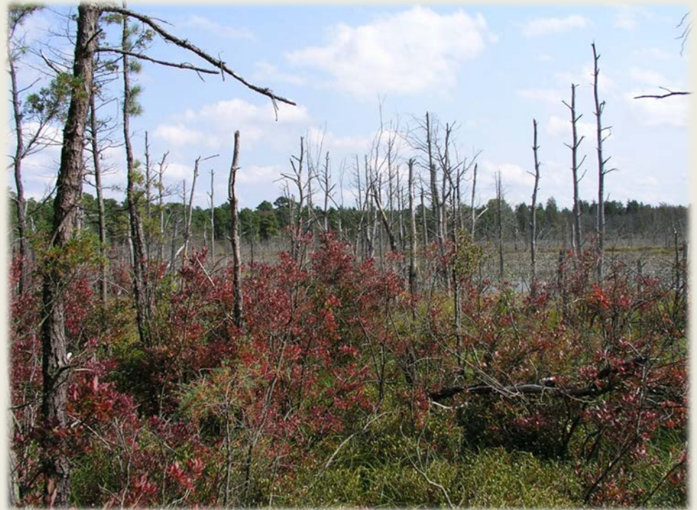
The 163 acre Jackson Land LLC property in the Toms River Corridor Jackson Township, Ocean County