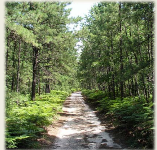
Above: Conectiv transmission line through forested area