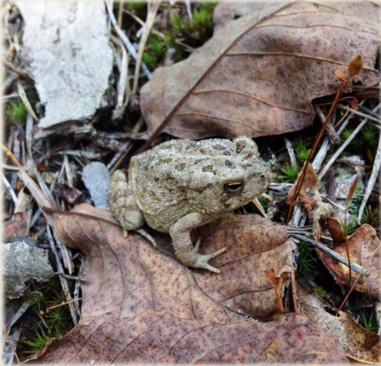
Fowler's toad on the 75 acre Maple Root River property Jackson Township, Ocean County