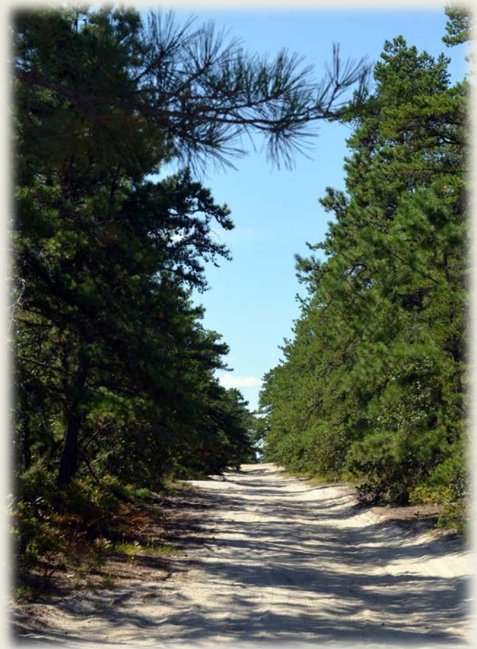
Sandy pine barrens trail on the 475 acre Zemel property